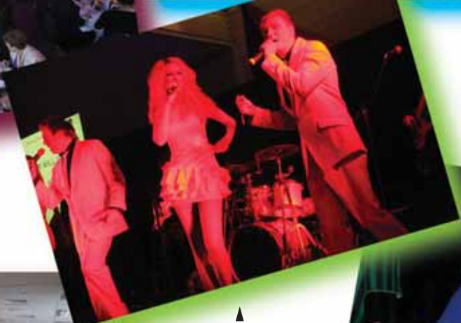
Friday Evening band