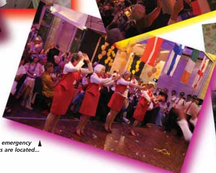
The emergency exits are located...