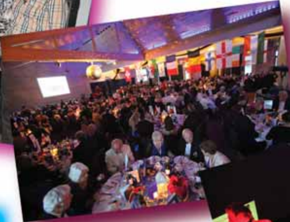
Friday evening President's Banquet