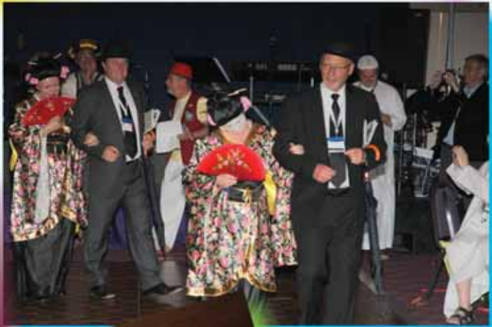
Old Japan comes to Ipswich - On an Eastern Promise