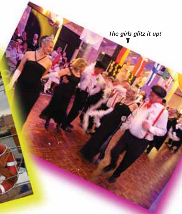
The girls glitz it up!