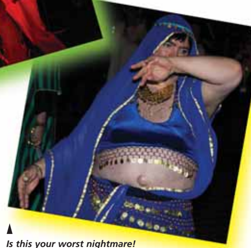
Is this your worst nightmare!